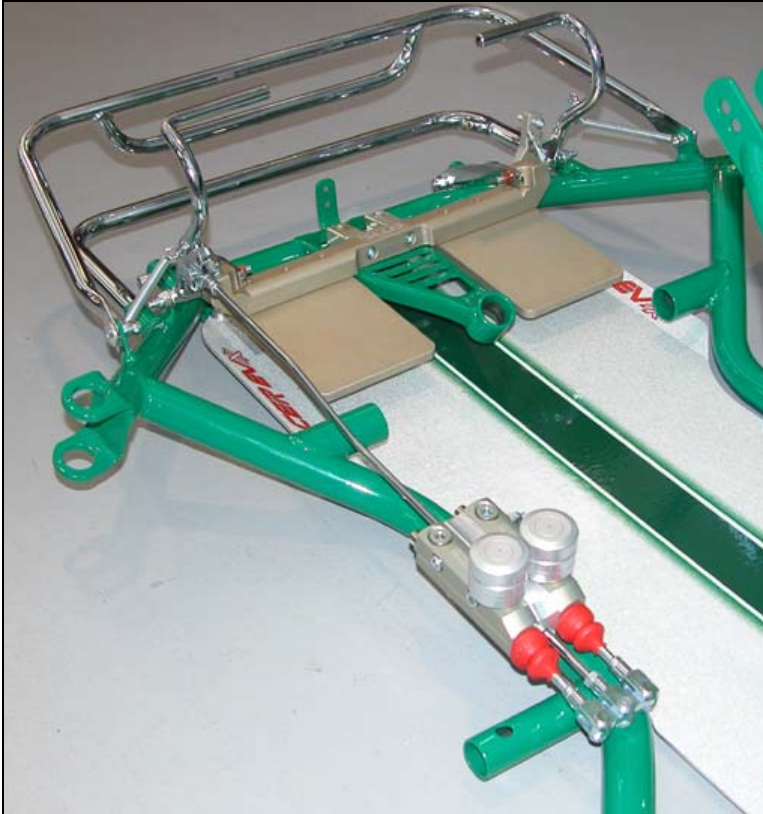
Assembling on the chassis

The rudder bar can be mounted on the new generation chassis only, since it is fixed to the steering column support.